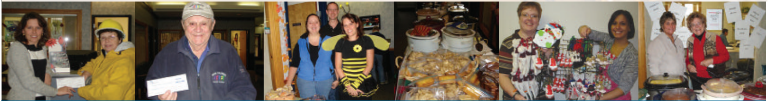
Fundraising Efforts, Fall 2010.