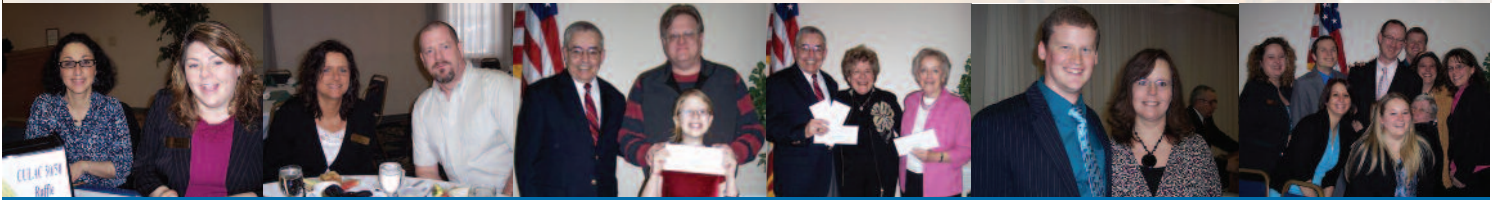
55th Annual Meeting held on March 5th